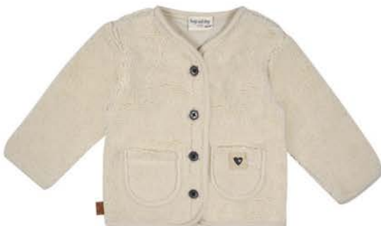
Teddy jacket 24085010 baby €34,99 toddler €39,99