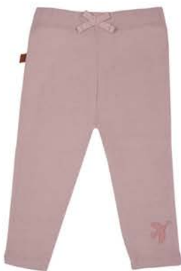
Legging cotton rib 24084007 baby €19,99 toddler €21,99