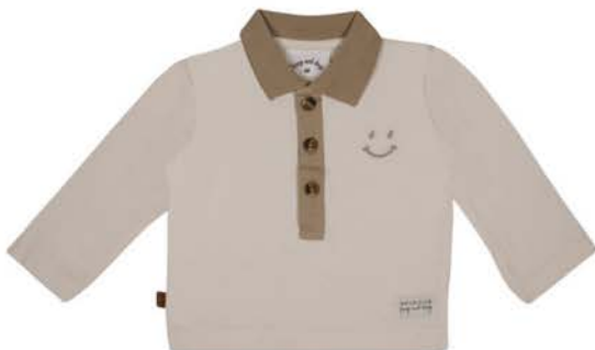
Smile Polo Shirt 24081007 baby €22,99 toddler €25,99