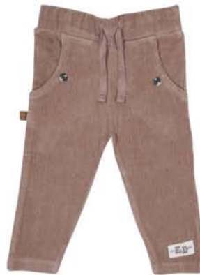
Velvet Rib Pants 24083002 baby €27,99 toddler €31,99