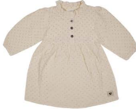
Dot dress 24085005 baby €32,99 toddler €34,99