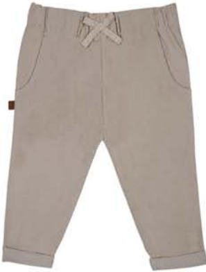
Pants cotton corduroy 24084004 baby €26,99 toddler €29,99