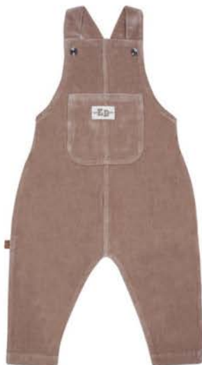
Dungaree 24083007 baby €34,99 toddler €39,99