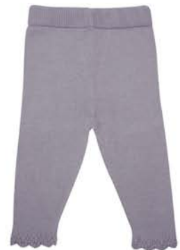
Knit legging 24086010 baby €21,99 toddler €24,99