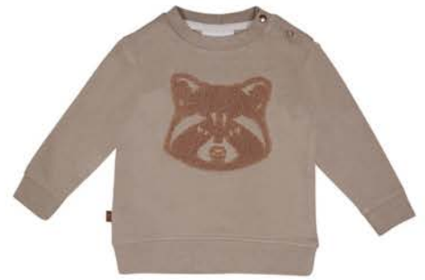
Raccoon Sweat Shirt 24082003 baby €23,99 toddler €26,99