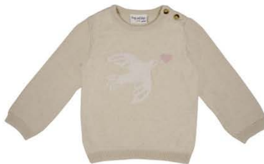
Sweater fine jacquard knit 24084008 baby €29,99 toddler €32,99