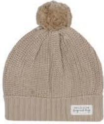
Knitted Beanie 24081001 €14,99