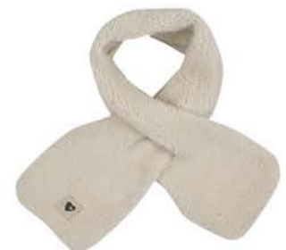
Teddy scarf 24085012 €9,99

*Available for babies in sizes 50/56 to 80 and toddler 86 to 104 Prijs wijzigingen voorbehouden