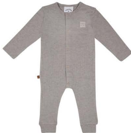
Raccoon Melange 10x1 Rib Onesie 24082008 baby €26,99

*Available for babies in sizes 50/56 to 80 and toddler 86 to 104