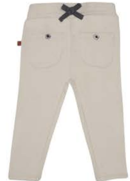
Amour pants 24085009 baby €22,99 toddler €25,99