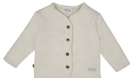
Smile Padded Jacket 24081009 baby €34,99 toddler €39,99

*Available for babies in sizes 50/56 to 80 and toddler 86 to 104