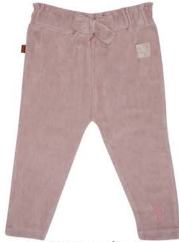
Pants velvet 24084002 baby €27,99 toddler €30,99