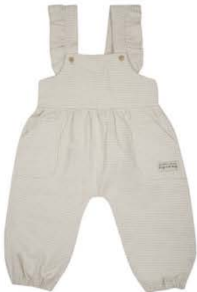
Dog tooth dungaree 24086007 baby €39,99 toddler €44,99