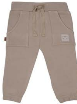
Raccoon Comfy Pants 24082002 baby €24,99 toddler €27,99