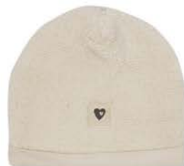
Teddy beanie 24085011 €10,99