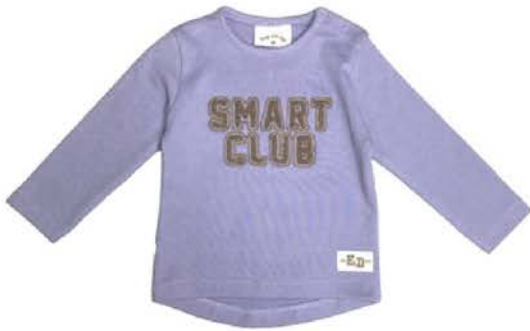
Smart Club T-Shirt 24083001 baby €19,99 toddler €21,99