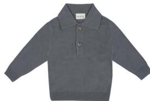
Knit polo 24087008 baby €29,99 toddler €32,99