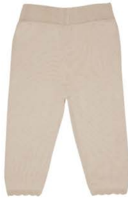
Knit pants 24086002 baby €21,99 toddler €24,99