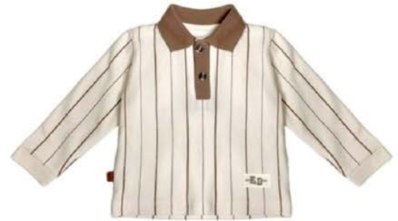
Polo Shirt 24083003 baby €22,99 toddler €25,99