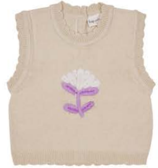
Knit spencer 24086003 baby €27,99 toddler €30,99