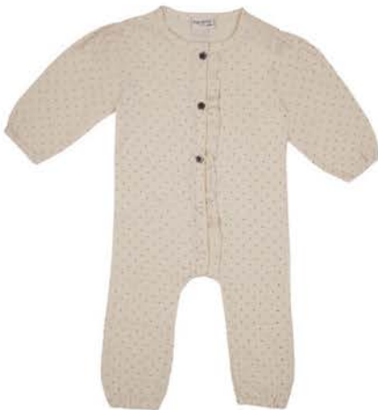
Dot onesie 24085007 baby €34,99 toddler €39,99