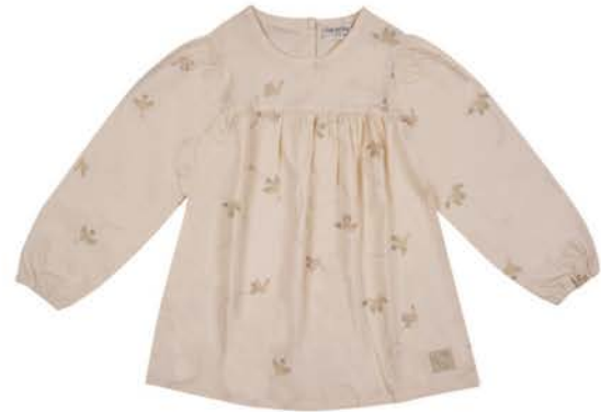
Dress light cotton poplin 24084006 baby €34,99 toddler €39,99