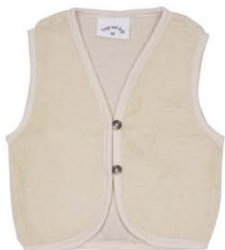
Teddy gilet 24087005 baby €23,99 toddler €26,99