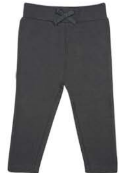
Rib legging 24085006 baby €17,99 toddler €19,99