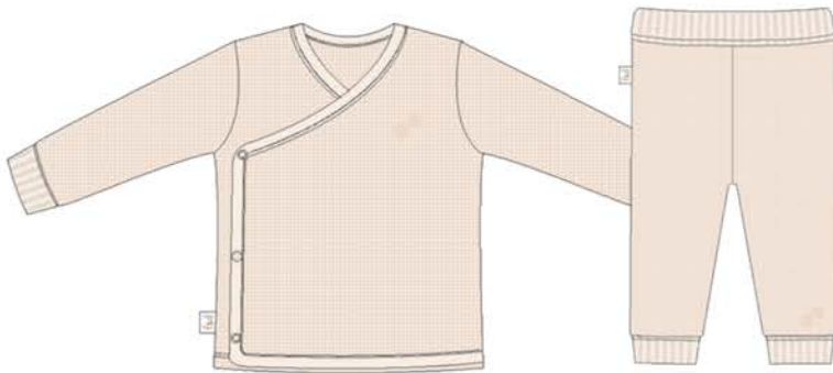
Wrap T-shirt Waffle 24037007 €24,99