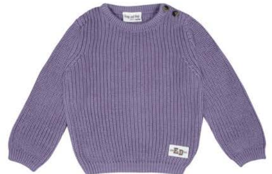
Knit-rib Sweater 24083006 baby €29,99 toddler €34,99