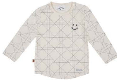
Checks T-Shirt 24081002 baby €19,99 toddler €22,99