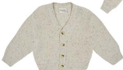
Knit-rib cardigan 24087002 baby €39,99 toddler €44,99