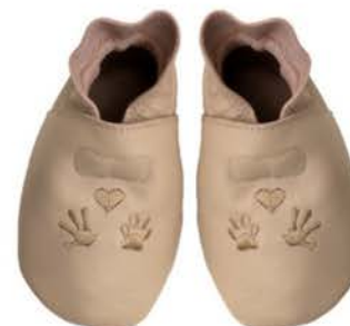
Leather shoes FDASS06 €29,99

*Available for babies in sizes 50/56 to 80 and toddler 86 to 104