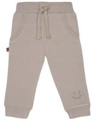
Smile Jogger Pants 24081006 baby €24,99 toddler €27,99