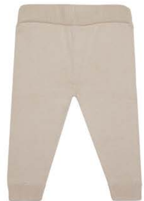
Pants fine knit 24084009 baby €22,99 toddler €25,99

*Available for babies in sizes 50/56 to 80 and toddler 86 to 104