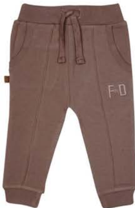
Jogging Pants 24083004 baby €24,99 toddler €27,99