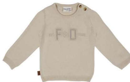
Fine Knit Sweater 24083008 baby €29,99 toddler €32,99