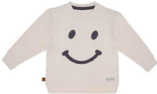
Smile Sweat Shirt 24081004 baby €23,99 toddler €26,99