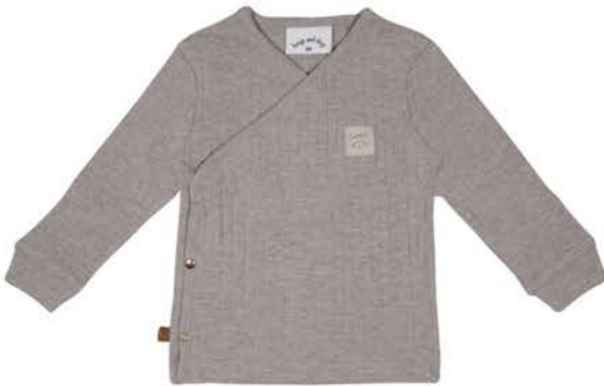
Raccoon Melange Wrap Shirt 24082004 baby €22,99