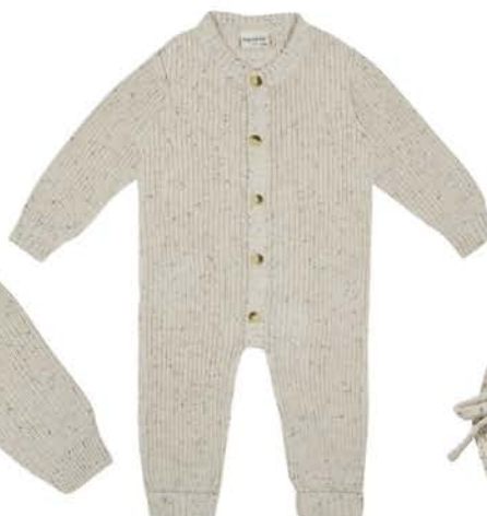
Knit-rib onesie 24087003 baby €44,99 toddler €49,99