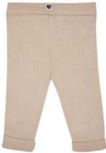
Rib pants 24085004 baby €22,99 toddler €24,99