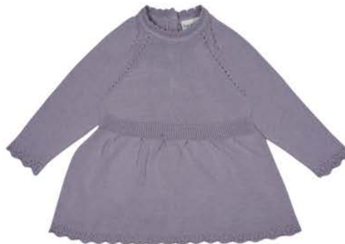
Knit dress 24086009 baby €34,99 toddler €39,99