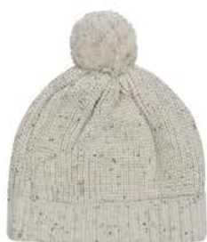
Knit rib Beanie 24087001 €15,99