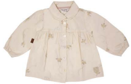
Blouse light cotton poplin 24084003 baby €32,99 toddler €35,99