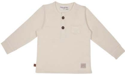
Raccoon LS Shirt 24082001 baby €19,99 toddler €22,99