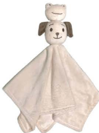
Cuddle cloth FDASS05 €9,99