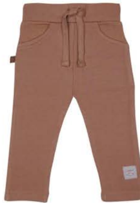
Raccoon Pants 24082005 baby €22,99 toddler €24,99