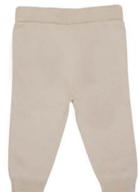
Fine Knit Pants 24083009 baby €22,99 toddler €25,99

*Available for babies in sizes 50/56 to 80 and toddler 86 to 104