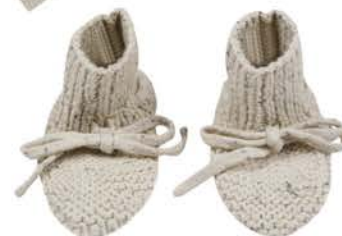
Knit-rib Booties 24087004 €19,99