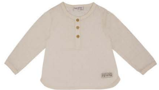
Woven dots shirt 24086006 baby €29,99 toddler €33,99