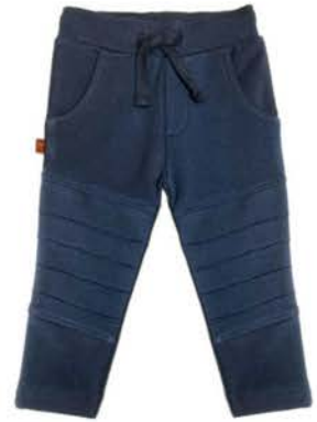
Biker Pants 24081003 baby €24,99 toddler €27,99