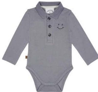
Smile Polo Romper 24081005 baby €22,99