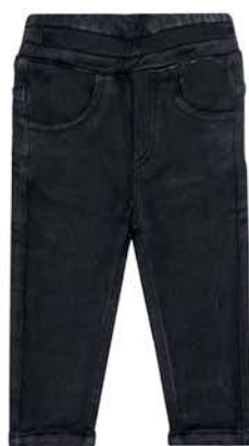
Jeans black 24087006 baby €24,99 toddler €27,99