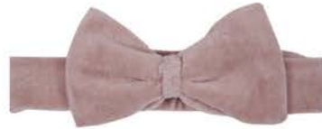
Hairband velvet 24084005 €8,99