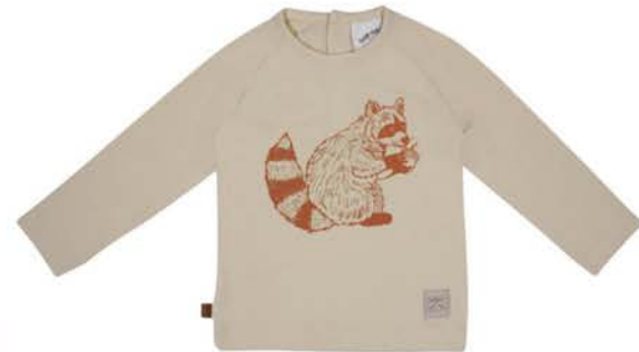
Raccoon Shirt LS 24082006 baby €19,99 toddler €21,99