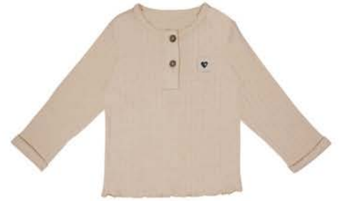
Rib T-shirt 24085003 baby €24,99 toddler €27,99