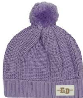
Knit-Rib Beanie 24083005 €14,99