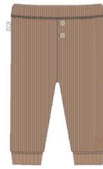
Pants Rib Taupe 24037003 €22,99