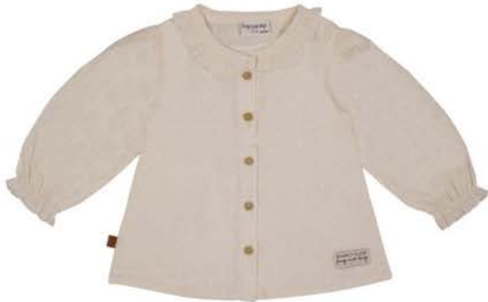
Woven dots blouse 24086004 baby €32,99 toddler €37,99