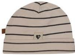
Stripe beanie 24085001 €9,99