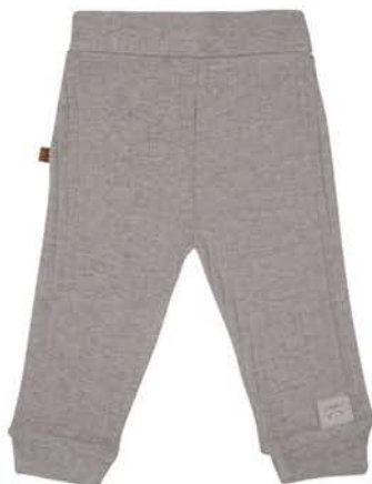
Raccoon Melange Rib Pants 24082007 baby €19,99 toddler €21,99