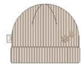
Beanie Rib Clay 24037012 €12,99

*Available for babies in sizes 44 to 74 Prijs wijzigingen voorbehouden