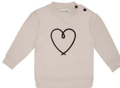
Heart sweat shirt 24085008 baby €23,99 toddler €26,99