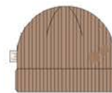
Beanie Rib Taupe 24037011 €12,99