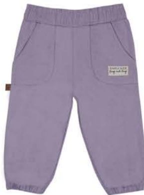
Twill pants 24086005 baby €27,99 toddler €30,99