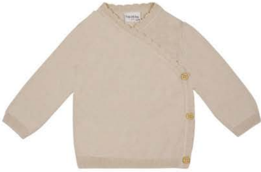
Knit wrap shirt 24086001 baby €34,99 toddler €37,99