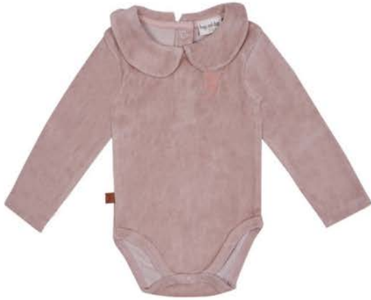
Romper velvet 24084001 baby €29,99 toddler €32,99