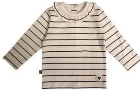
Strip T-shirt 24085002 baby €19,99 toddler €21,99