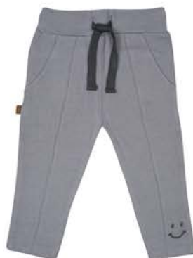
Smile Pleated Pants 24081008 baby €22,99 toddler €25,99