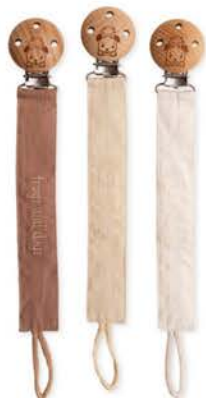
Pacifier cord FDASS04 €8,99